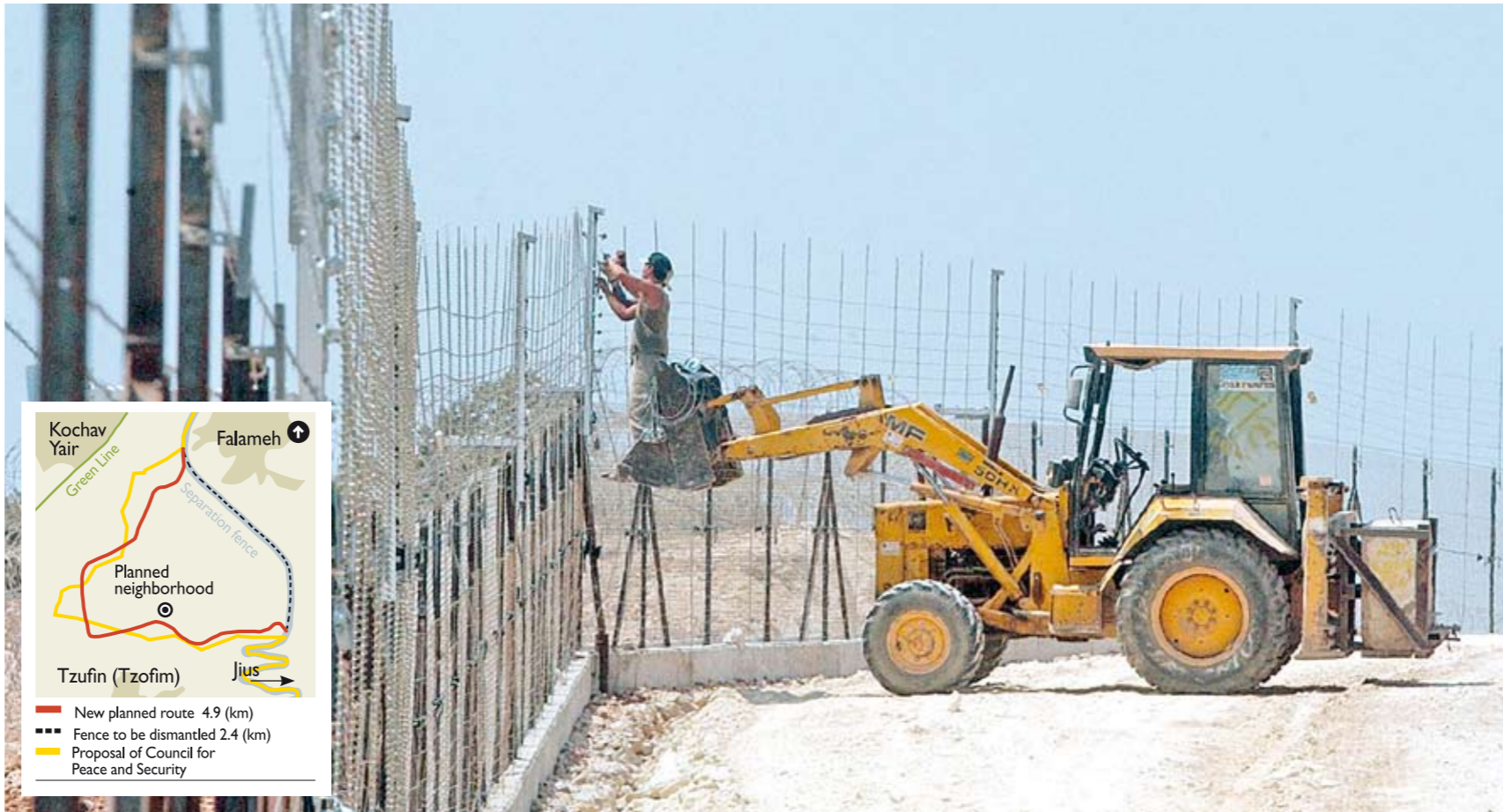
Construction work on the West Bank separation fence near Qalqilyah in 2003. The IDF refused to allow its people to defend the fence route in the High Court.

In its announcement, the state claimed that the new route – which is almost identical to that originally proposed by the council – "provides a reasonable security solution to the various threats." It attributed its change of heart to the Bil'in ruling, which forbade the route from being based on planned settlement expansions.